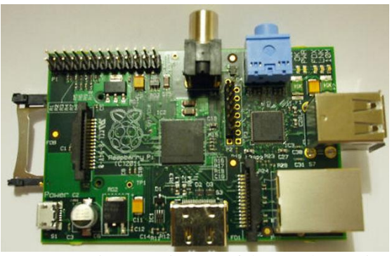
Figure2. Diagram of the Raspberry Pi

The GPU hardware is accessed via a firmware image which is loaded into the GPU at boot time from the SD card. The firmware image is known as the binary blob, while the associated ARM coded Linux drivers were initially closed source. Application software uses calls to closed source runtime libraries which in turn calls an open source driver inside the Linux kernel.